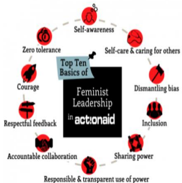
Figure 2: Action Aid's Ten Principles

The most basic action that humanitarian leaders can take to adopt a more feminist approach and realize some of the key goals of humanitarian action is to engage women in leadership decisions. This, according to learning from ActionAid