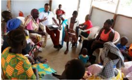
Consultation meeting with refugee women with disabilities in Bididi settlement, Uganda

Identification of GBV-related risks, barriers, and strategies: All three projects conducted community consultations with different gender and age groups of persons with disabilities to identify GBV-related risks, barriers, and strategies to strengthen their inclusion (actions 1.1 and 1.3).