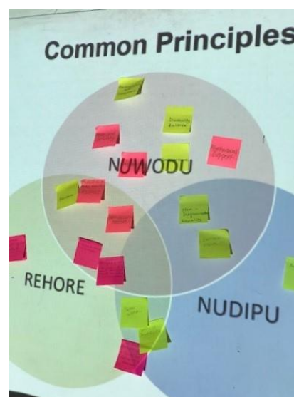
from Principles Activity, Uganda