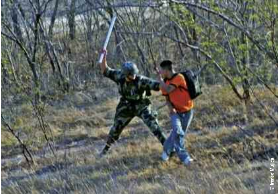
A member of the Mexican Navy wields a baton during an assault on migrants near Las Palmas in Niltontepec municipality, Oaxaca state, 31 March 2008.

how one migrant fled and was chased by an INM official holding a short baton that he placed on the man's neck. Villagers said the man was convulsed by an electric current and fell dazed to the floor. He was then forced to his feet and taken away by the INM agents. The man may already have been effectively in custody when the stun baton was applied and posed no threat to the officials or to bystanders. 38 When villagers complained about the treatment of the migrants, INM officials threatened to arrest one woman for people smuggling because of the humanitarian assistance she and others provided for migrants. CNDH officials arrived the following day to investigate; their findings have yet to be published. The INM has consistently denied that its agents use electric shock batons in any circumstances.